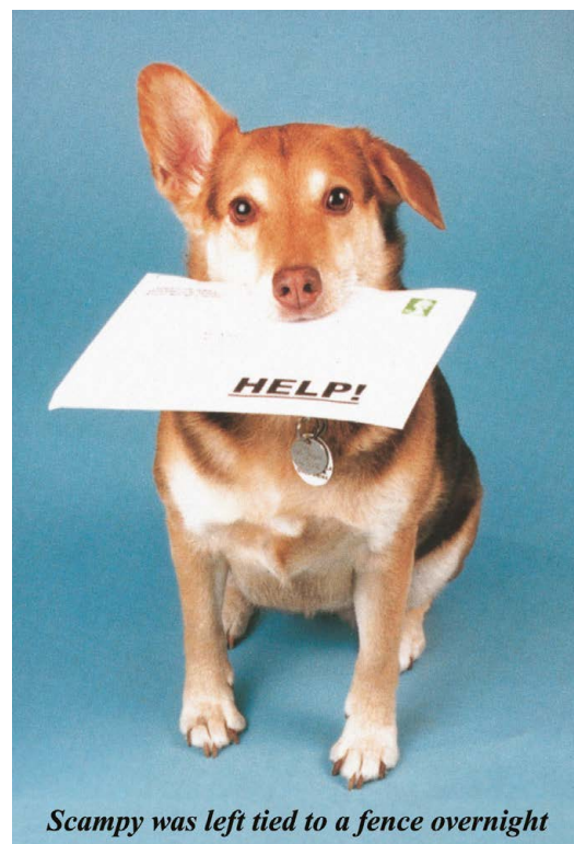
Scampy was left tied to a fence overnight