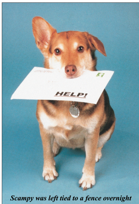
Scampy was left tied to a fence overnight

PLEASE include Friends of the Animals in your will